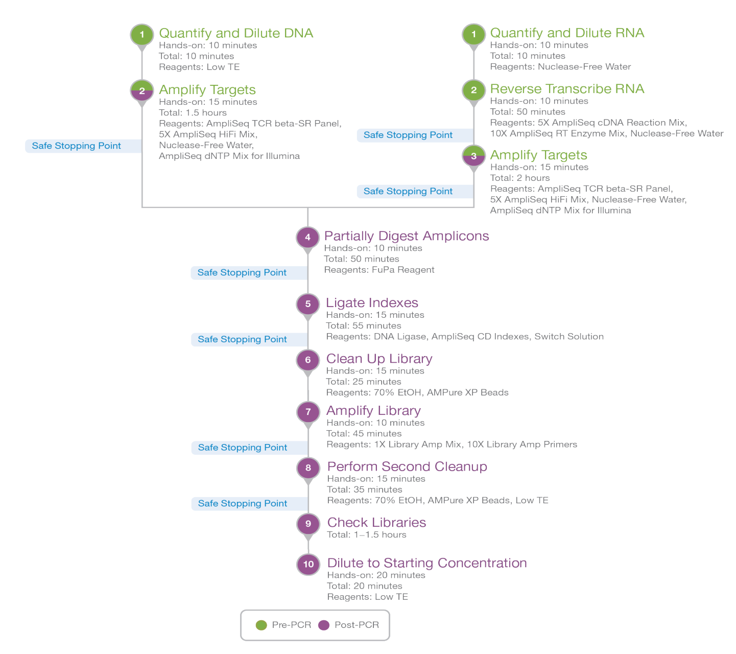
Figure 1 AmpliSeq TCR beta-SR Panel Workflow

The following diagram illustrates the AmpliSeq for Illumina TCR beta-SR Panel workflow. Safe stopping points are marked between steps.