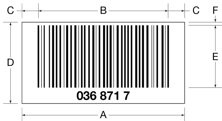
Figure 2 Barcode Dimensions